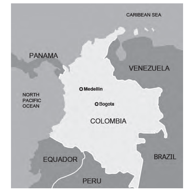
Medellín in regional context

Conscious of this new assigned status, the first question that arose was: how does one present Medellín's inherent complexities from a new angle, while adding another interpretation to the prevailing discourses in the art and architectural press on the role of these disciplines in the (re)constitution of urban societies? Starting with this question our preoccupation has been how to conjure up a different perspective to that presented in the literature that